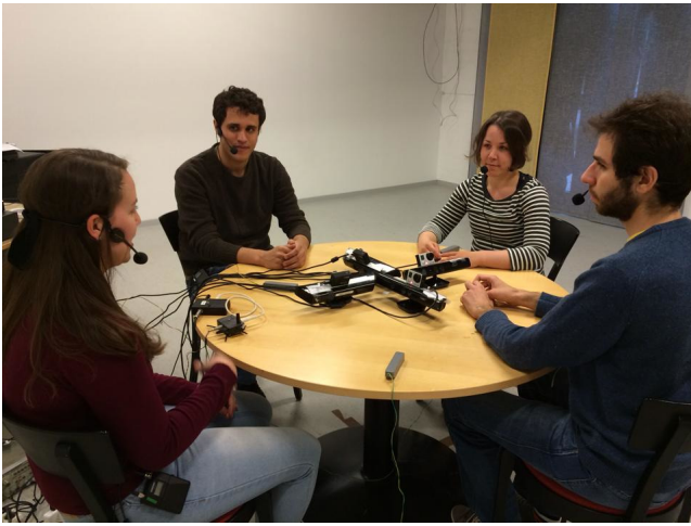
Figure 1: The KTH-Idiap corpus