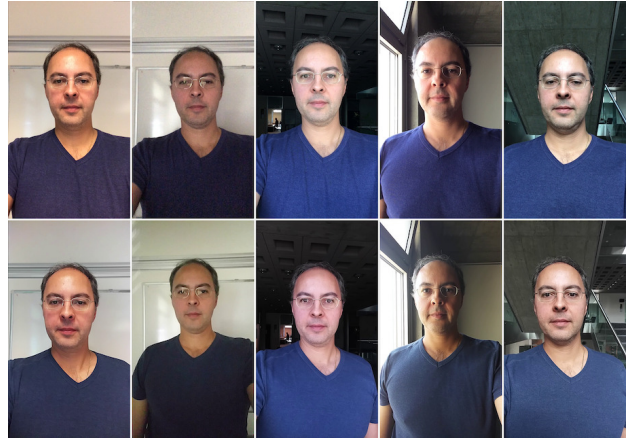
Fig. 1: Examples of real accesses in different scenarios. Top row: samples from real accesses captured on a smartphone. Bottom row: samples captured on a tablet. Columns from left to right show examples of video frames in controlled , adverse , direct , lateral , and diffuse scenarios, respectively.

When recording the video, the user was asked to stand, to hold the mobile device at the eye level and to center the face on the screen of the video capture application. Each video is approximately 10 seconds long ( \sim 300 frames @ 30fps) and HD resolution ( 720 \times 1280 ). (Note that the videos in the MSU-MFSD database have relatively lower resolution.) In each lighting condition the user captured two videos, one using an iPad Mini 2 6 tablet and another using a LG-G4 7 smartphone.