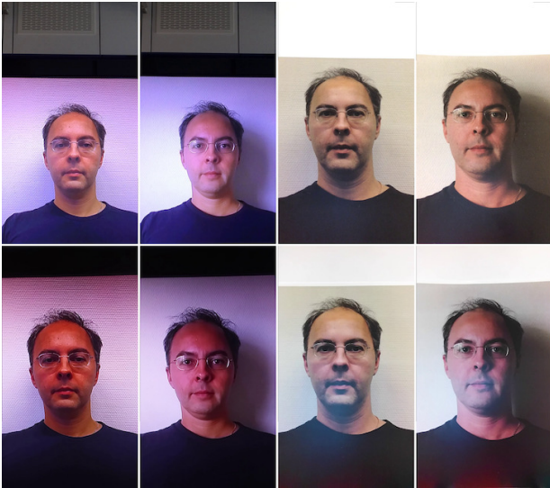
Fig. 2: Samples of the different presentations attack instruments (PAI). Top row: samples from attack accesses captured on a smartphone. Bottom row: samples captured on a tablet. Columns, from left to right, show examples of mattescreeen-lighton , mattescreeen-lightoff , print-lighton , and print-lightoff , respectively.

Each attack was recorded on each mobile device (tablet and smartphone) for 10 seconds. For recording mattescreeen attacks the capturing mobile device was supported on a fixed support. Each print video, however, was captured in two different attack modes: hand-held attack , where the operator holds the capture device; and fixed-support attack , where the capture device is fixed on a support. Thus, four different PAIs are represented in REPLAY-MOBILE. Figure 2 shows examples of attacks available in the database.