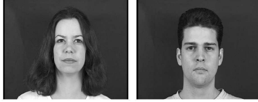
(a) XM2VTS (controlled conditions): uniform background and lighting