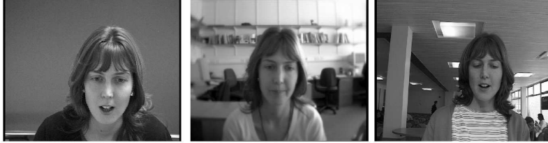
(b) BANCA English (uncontrolled conditions): complex background and lighting variability