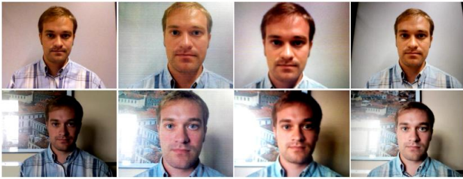
Fig. 1. Examples of real accesses and attacks in different scenarios. In the top row, samples from controlled scenario. In the bottom row, samples from adverse scenario. Columns from left to right show examples of real access, printed photograph, mobile phone and tablet attacks.

(1) hand-based attacks (the operator holds the attack media or device using their own hands); and (2) fixed-support attacks (the operator sets the attack device on a fixed support so they do not move during the spoof attempt). The first set of (hand-based) attacks show a shaking behavior which can sometimes trick eye-blinking detectors [8]. Figure 1 shows some frames of the captured spoofing attempts.