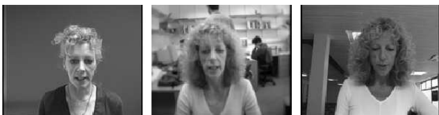
Figure 1. Example images from the BANCA database. Left to right: controlled , degraded and adverse conditions.

where FAR and FRR are the False Acceptance Rate and False Rejection Rate, respectively. Since in real life the decision threshold has to be chosen a priori , it is selected to obtain Equal Error Rate (EER) performance (where