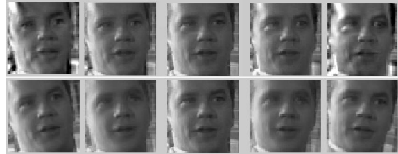
Figure 2. Two Types of Virtual Images.

tained by applying direct calculation of tangent vectors according to (5). We can thus see that despite the accurate tuning of Gaussian filtering and other “tricks”, only very local rotations are reasonable.