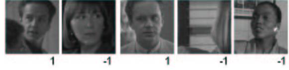
Figure 1. Some Images of the Database

approach. Two types of invariant transformations were studied: rotations (5) and scalings (6).