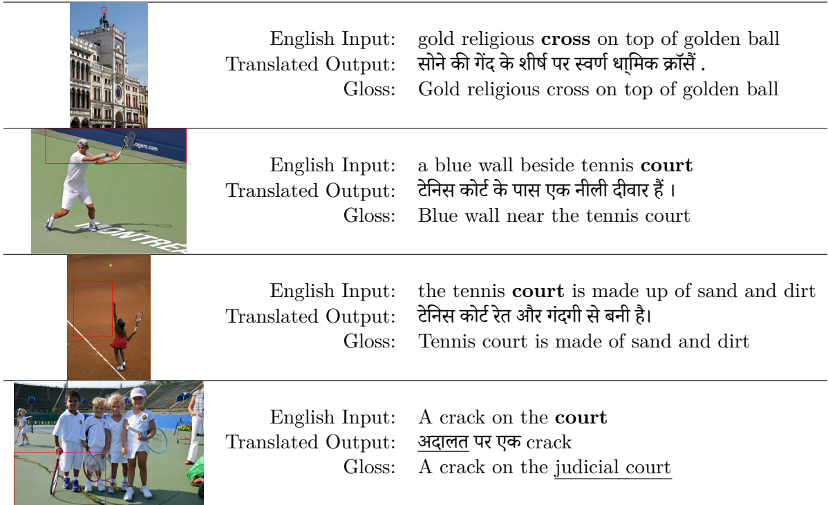
Figure 2: Sample Hindi output as generated for the challenge test set. The ambiguous source word is bolded in the English input, errors are underlined in the MT output and the gloss. The associated source images are given for the reference purpose only to judge our NMT system translation quality, we have not used any image features in our experiment.

Comparing the scores of D- and E-Test on the one hand and C-Test on the other hand, we see that D- and E-Test are much easier for the system. This can be attributed to the identical distributional properties of D-Test and E-Test as the model observed for HVG in the training data. According to Parida et al. (2019a), C-Test also comes from the Visual Genome but the sampling is different, each sentence illustrating one of 19 particularly ambiguous words ( focus words in the following).