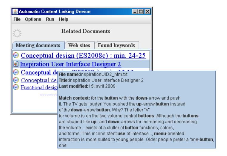
Fig. 3. Snapshot of AMIDA ACLD's widget UI, showing the tab with the list of relevant documents at a given moment, with explicit document and snippet labels. Hovering over a label displays the metadata associated with the document, as well as excerpts where the keywords were found. Tabs displaying detected keywords and retrieved websites are also available.

3. Keywords recognized in the respective system turn, or alternatively all recognized words with highlighted keywords.