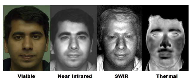
Figure 1. This figure shows the facial images of the same individual acquired using four distinct imaging modalities (Images taken from MCXFace dataset [12]). The task in HFR is to facilitate cross-domain matching while overcoming the challenges posed by the domain gap.

Face recognition (FR) has become a popular method of access control due to its effectiveness and ease of use. Thanks to convolutional neural networks (CNN), most state of the art FR methods achieve excellent performance in "in the wild" conditions and even "human parity" in face recognition performance [23]. Standard FR systems operate in a homogeneous domain, which means that enrollment and matching are performed using the same modality, typically with face images captured with an RGB camera. However, in some cases, matching in a heterogeneous environment may be advantageous. For example, near-infrared (NIR) cameras, which are common in mobile phones and surveil-