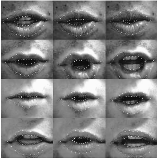
Fig. 2: Examples of image sequences with lip tracking results.

some recognition tests by including scale differences (delta scale).