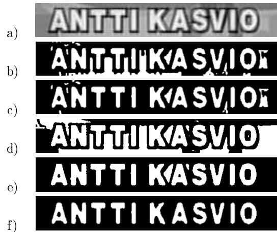
FIG. 3 – Applying grayscale consistency: a) original image b) text layer (GEM K=3 ) c) same as b), after the connected component analysis d) text layer (Otsu), e) same as d), after the connected component analysis, f) same as c), after the gray level consistency step.

N is the true total number of characters, N_r is the number of correctly recognized characters and N_e is the total number of extracted characters. Additionally, we compute the word recognition rate to get an idea of the coherency of character recognition within one solution. For each text image, we count the words from the ground truth of that image that appear in the string result. Results are listed in table 1.