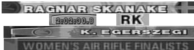
FIG. 1 – Examples of located text in video

method for segmenting and recognizing text embedded in video and images is proposed in this paper. In the method, multiple segmentation of the same text region is performed, thus producing multiple hypotheses of binary text images. The segmentation algorithm is stated as a statistical labeling and is based on a markov random field (MRF) model of the label map. Background regions in each hypothesis are then removed by performing a connected component analysis and by enforcing a more stringent constraint (called GCC) on the text characters grayscale values using a robust 1D-Median operator. Each text image hypothesis is then processed by an optical character recognition (OCR) software. The final result is then selected from the set of output strings. Results show that both the use of multiple hypotheses and the GCC significantly improve the results.