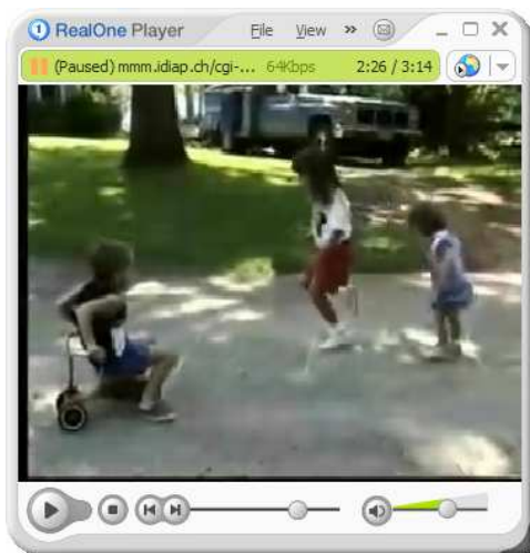
Figure 3: RealPlayer VCR controls

Each time a play button is pushed on the HTML page, a RealPlayer window pops up with basic VCR controls (see Figure 3). As illustrated in Figure 1, a CGI script ( SMILmaker ) dynamically generates a SMIL file (SMIL spec, 2001). This program takes as parameters the video source location (compressed in RM on the media file server), as well as the starting and ending timestamps. RealPlayer permits basic VCR capabilities to play and navigate within the selected segment (entire video or a specific scene or shot).