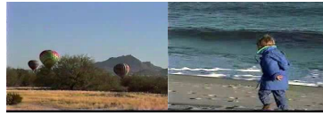
Figure 4: Examples of target images

We conducted a small user study to observe people's behavior while using the video browser. We selected two video segments from the Kodak Home Video Database, and selected a single frame from each of these videos at random as the target image . We ensured that these target images did not include any of the automatically selected key frames that might appear in the browser interface.