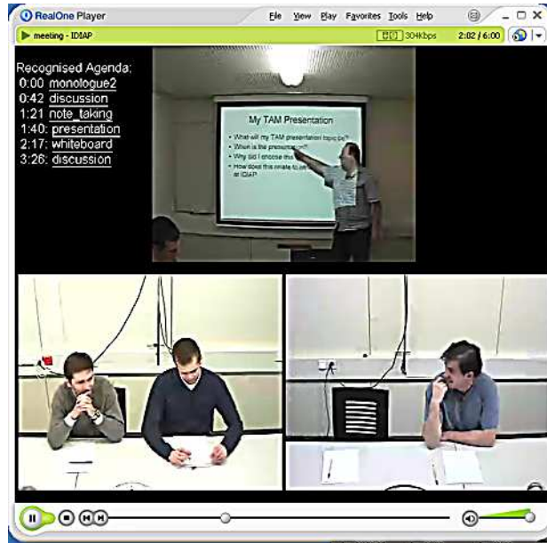
Figure 4: Simple meeting browser interface, showing recognised meeting actions.