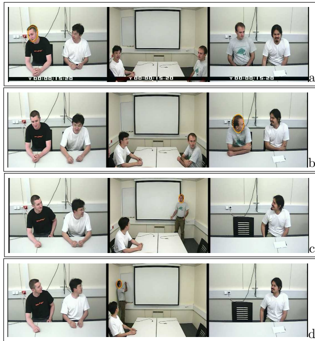
Figure 2: Tracking speakers in the meeting room. Frames 100, 1100, 1900, and 2700.

by (i) generating candidate configurations from the dynamics ( prediction ), and (ii) measuring their likelihood ( updating ), in a process that amounts to random search in a configuration space. Data fusion can be introduced in both stages of the PF algorithm.