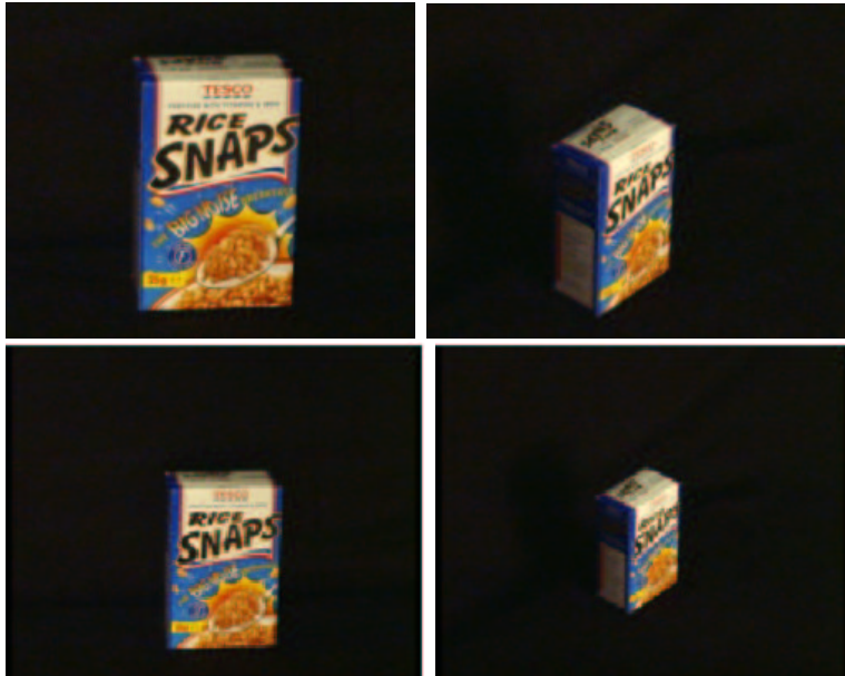
Figure 2: Examples of Soil-24A object images at different angles (0 and 45 degrees) and different resolutions (100% and 50%).

The described method was tested on the SOIL-24A database which is a subset of the SOIL-47A database [1], described in [4]. This subset is composed of 24 images of colorful, planar, household objects; see Fig. 2 for sample images. Object are represented by images of approximately 220x220 pixels at full size. This database was created with the purpose of evaluating the degradation of object recognition methods with respect to the change of viewing angle. In this way we obtain the overall behavior of the system to a possible random positioning of objects. We have sub-sampled the original database to half resolution since objects in human interaction scenes will be smaller than the ones in the original database.