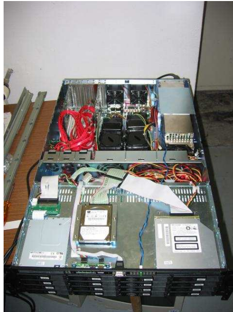
Figure 3: The MMM server