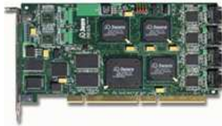
Figure 1: 3ware Escalade 8506-8 SATA RAID Controller

The fourth generation of those cards is supporting the new SATA disks which seems to be the future reference for low price storage. However the prices are a little bit more expensive (6than normal IDE disks,we have the big advantage of a better performance in addition to the much more smaller cables size which is better for the ventilation of a small rack case 4.2.4. The final choice has so be done on the 3ware Escalade 8506-8 SATA RAID Controller [3].